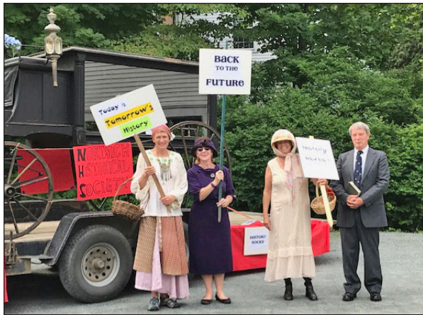
The hearse made its way down Main Street during the Norwich Fair parade in July.