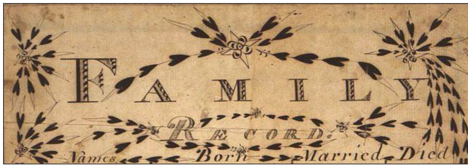
Our new monthly genealogy drop-in group draws genealogists from throughout the Upper Valley.