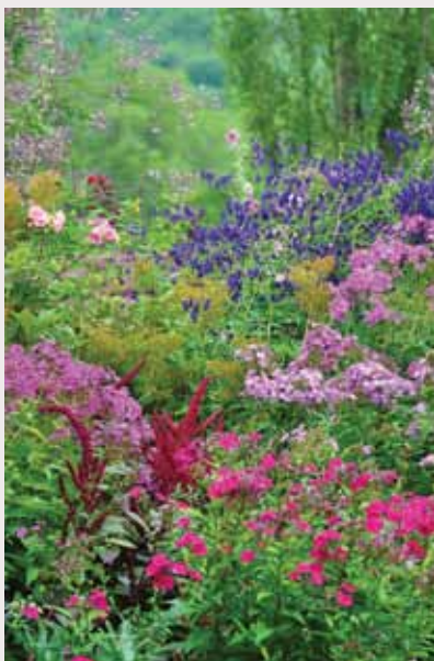
Bill Noble's garden

It is a day not to be missed. Please join us!