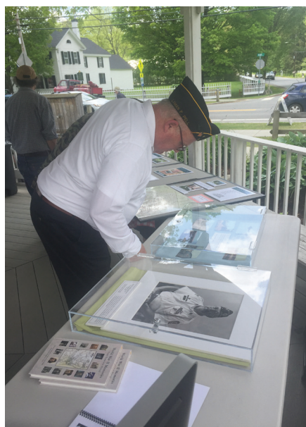
NHS helped celebrate Memorial Day in 2019 with an exhibit on Norwich veterans in the bandstand.