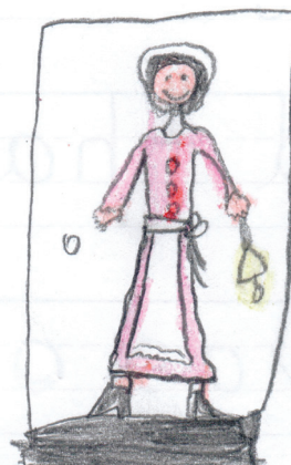
An artistic rendering of the NHS teacher by a first grade visitor from the Marion Cross School.

GIS GPS Mapping Leahy Press Spencer-Julian Antiques W. A. Smith Auctions