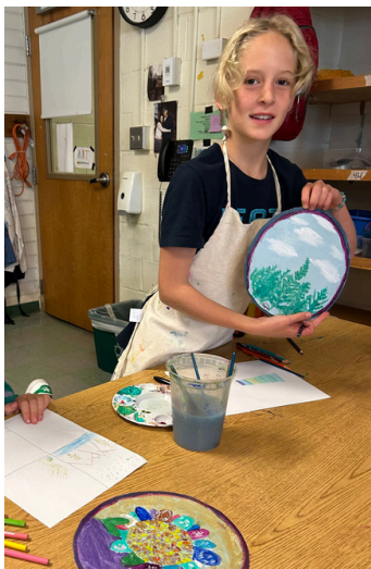
Above: Marion Cross students combined science, art, and community service while helping us create a new community mural celebrating Norwich conservation.

277 Main Street • PO Box 1680 Norwich, VT 05055 802.649.0124 info@norwichhistory.org www.norwichhistory.org